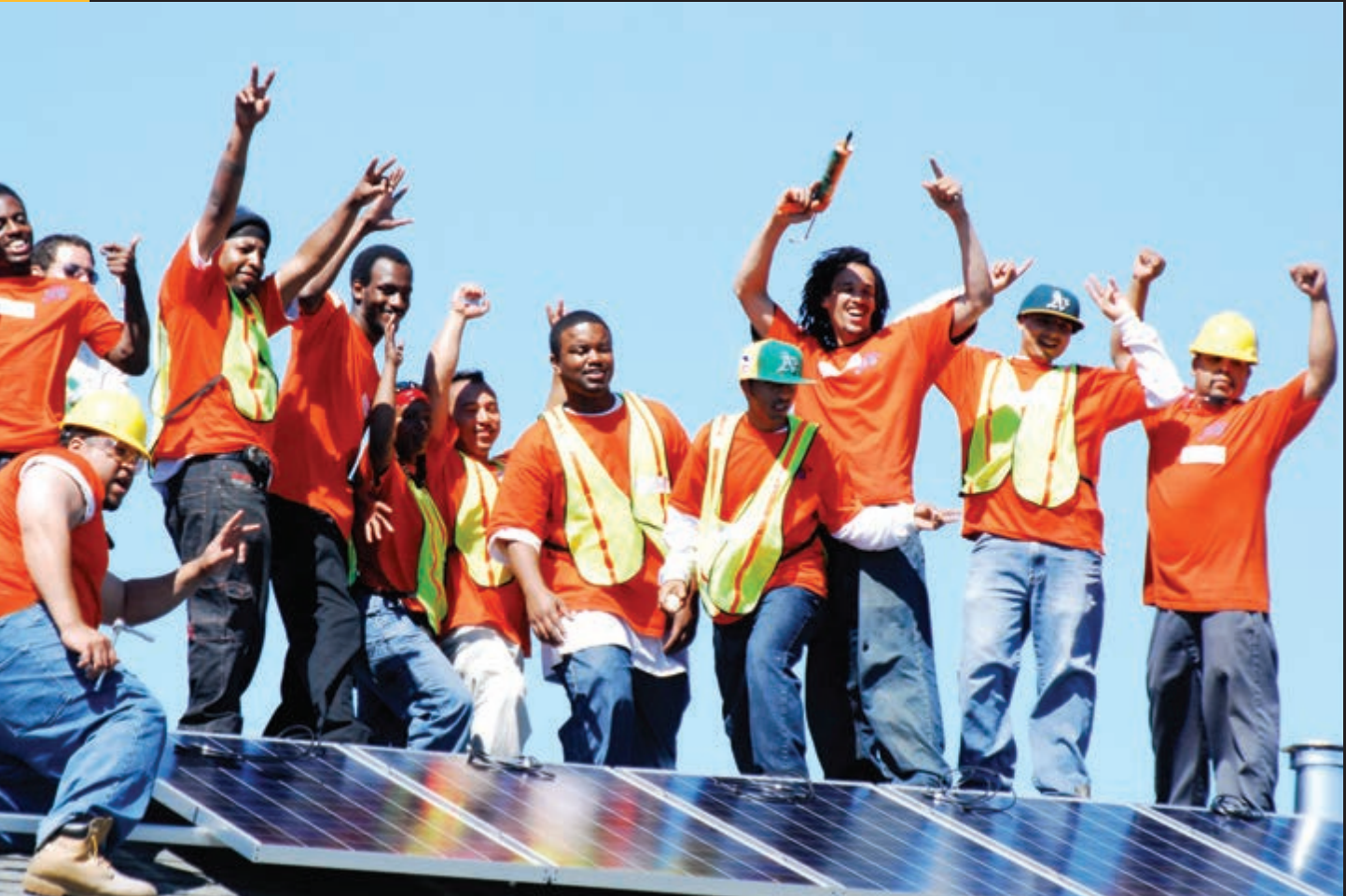
Job trainees get hands-on experience installing a solar electric system for a low-income homeowner in Richmond, CA.

We define urban resilience as the capacity of a community to anticipate, plan for, and mitigate the risks—and seize the opportunities—associated with environmental and social change.